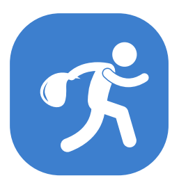
Property theft and vandalism