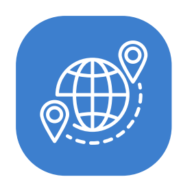
Remote, geographically dispersed locales