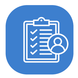
Compliance and regulatory requirements