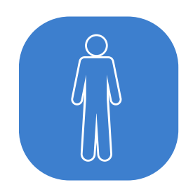
Protection of tenants/visitors